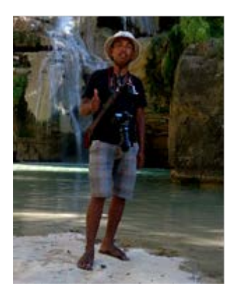
TOKY NATURALIST GUIDE