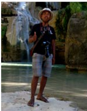
TOKY NATURALIST GUIDE