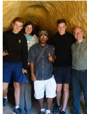
HERY NATURALIST GUIDE