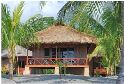
Hotel Happy-happy Bajawa: