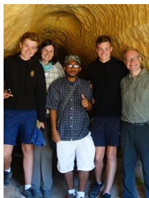
HERY NATURALIST GUIDE