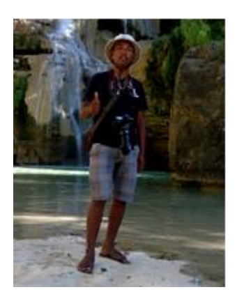
TOKY NATURALIST GUIDE