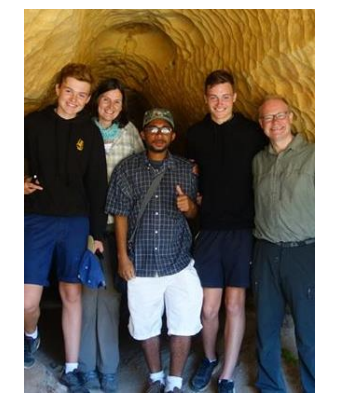
HERY NATURALIST GUIDE