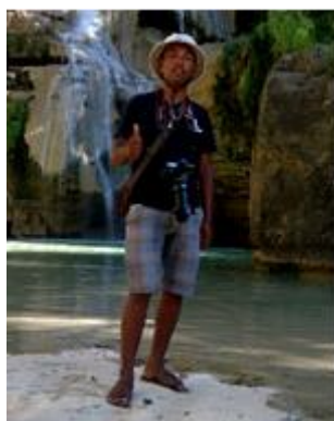
TOKY NATURALIST GUIDE