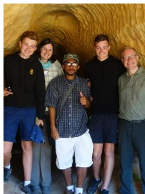
HERY NATURALIST GUIDE