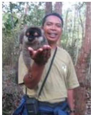
MAMY NATURALIST GUIDE

Our guides are at the forefront of your trip, so it's important you know who will be looking after you and showing you the wonders of this extraordinary country. We pride ourselves on having talented, trustworthy, knowledgeable and caring local guides. We have both Naturalist guides and Adventurist guides who will make your trip even more special. Nobody knows Madagascar quite like them!