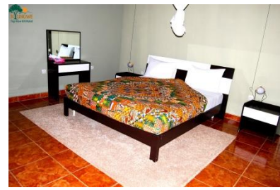
Kibuye, Lake Kivo Eco Lodge- Rwiza Village http://rwizavillage.org/