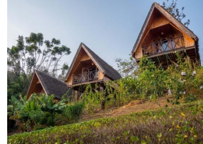
Gisenyi Paradis Malahide Hotel https://www.paradisemalahide.com/