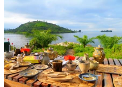
Musanze La Locanda http://www.lalocandarwanda.com/