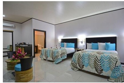
Trapp Family Lodge Monteverde