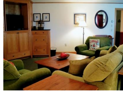
BEACH EXTENSION: TANGO MAR RESORT