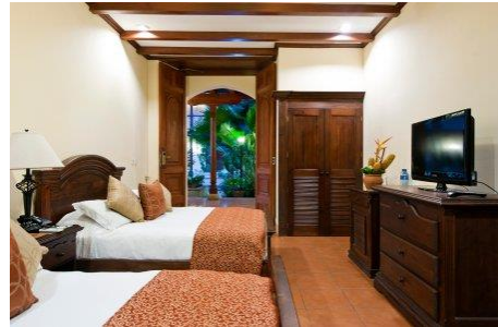
Comfort Inn La Union Puerto La Union (No Website)