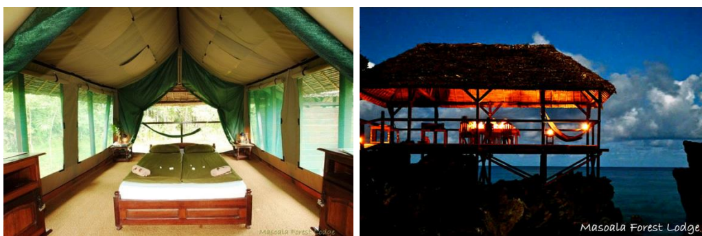
Masoala Forest Lodge

After dinner, your guide meets you to discuss possible excursions for day 2.