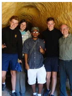
HERY NATURALIST GUIDE