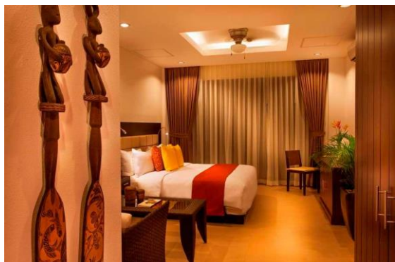
Photo of hotel