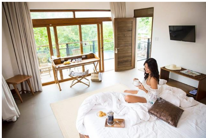
Photo of hotel