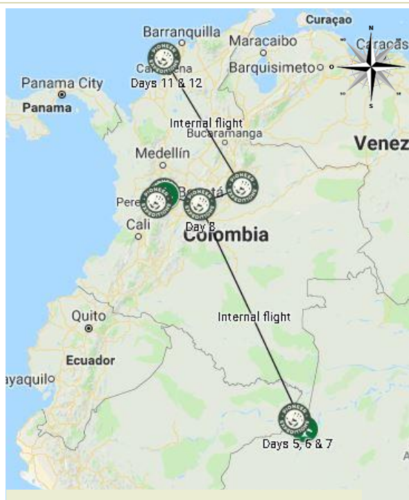
Colombian Wildlife Discovery